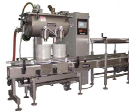
Two Head Shown Model PG52-TG-A-R