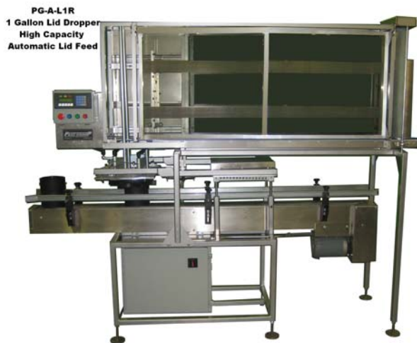
PG-A-L1R 1 Gallon Lid Dropper High Capacity Automatic Lid Feed

The operator loads the stacks until it is full, and occasionally inserts additional lid stacks to keep this hungry lid feeders thirst for high production quenched! We can configure the footprint of this unit to make it as long as possible to maximize the amount of lids that can be queued up at one time. Your operators may have to find a new "water cooler".